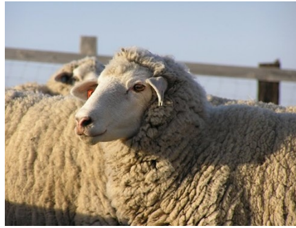
Columbia (produces medium wool)