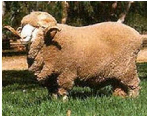
Merino (produces fine wool)