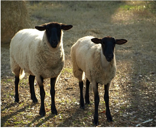
Suffolk (produces medium wool)