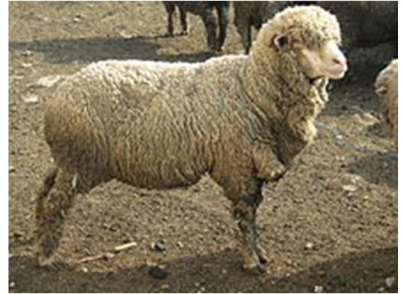
Rambouillet (produces fine wool)