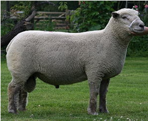
Southdown (produces medium wool)

Each breed for each species has characteristics and attributes that make it popular in general and for specific purposes such as reproductive qualities versus meat qualities versus wool production qualities or range hardiness.