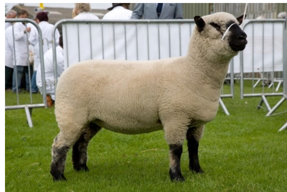
Hampshire (produces medium wool)