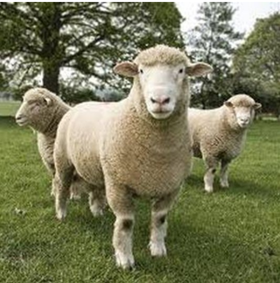
Dorset produces medium wool